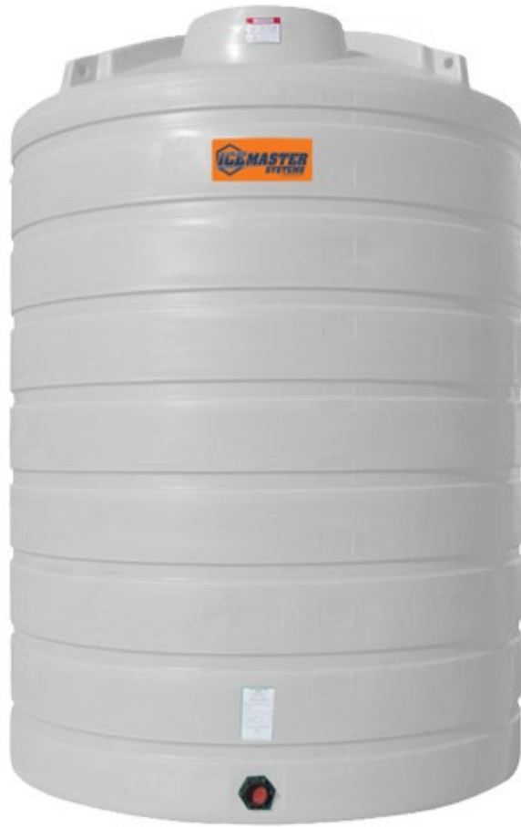
3,000 Gallon Brine Storage Tank 90" Diameter x 125" Height